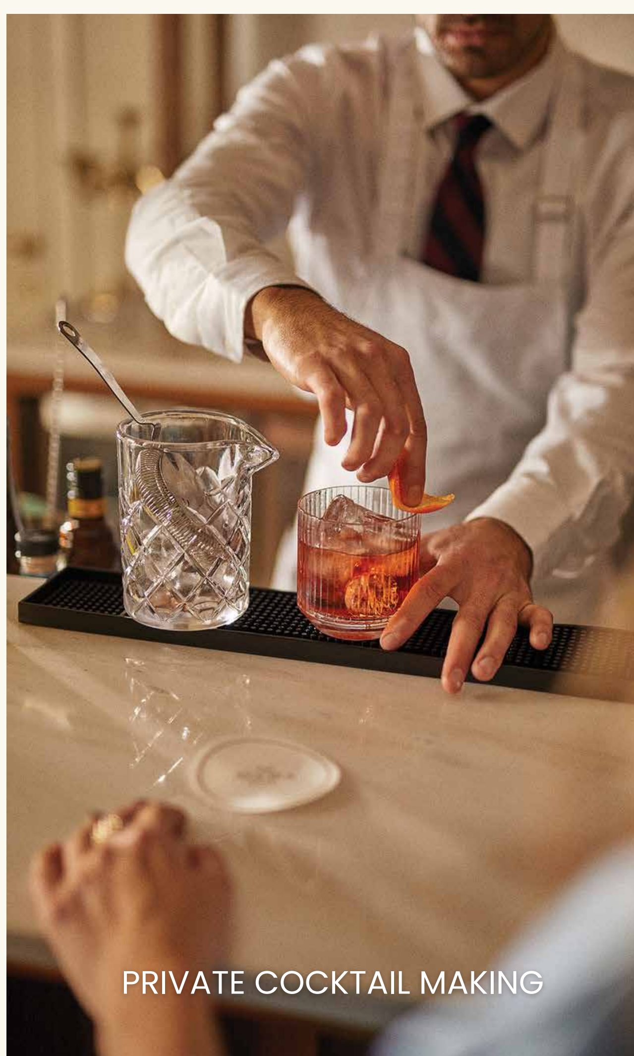
PRIVATE COCKTAIL MAKING