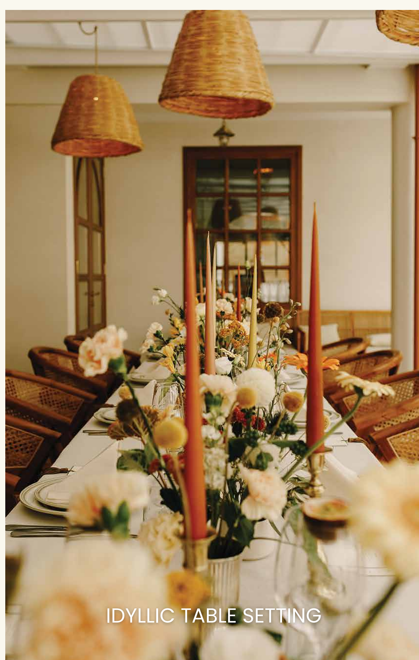
IDYLIC TABLE SETTING