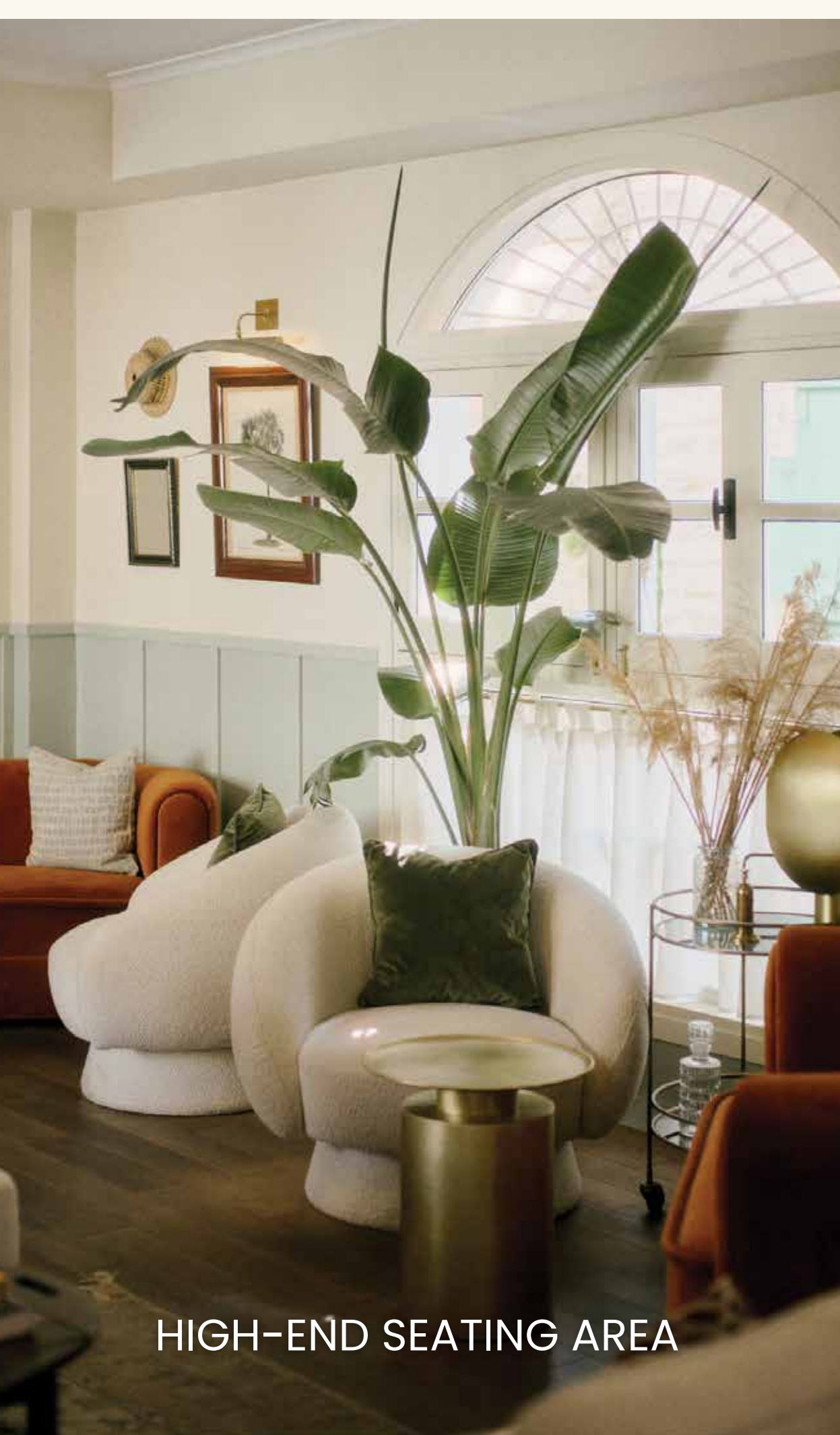
HIGH-END SEATING AREA